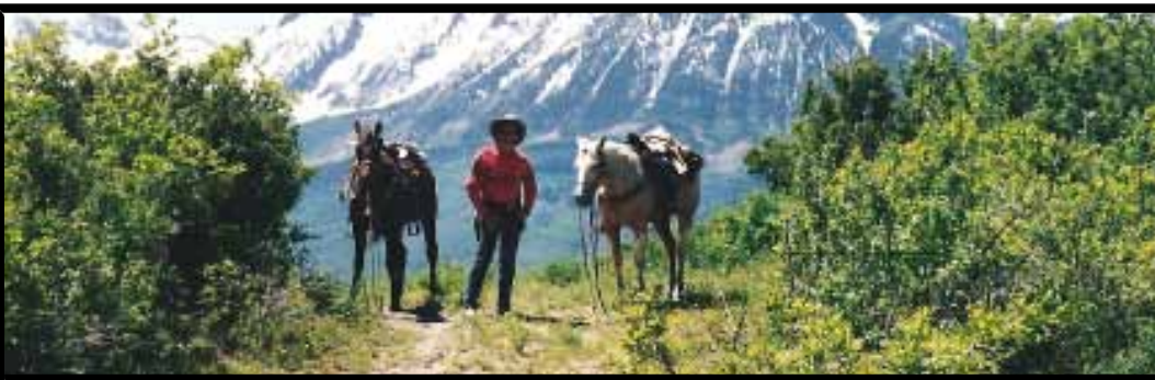
Imagine that you were the one who took this photo on a ride in the Colorado wilderness! (Yes, that's your horse on the right.)